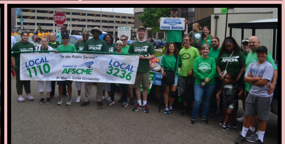
Bloomington, Illinois 2022 Labor Day Parade